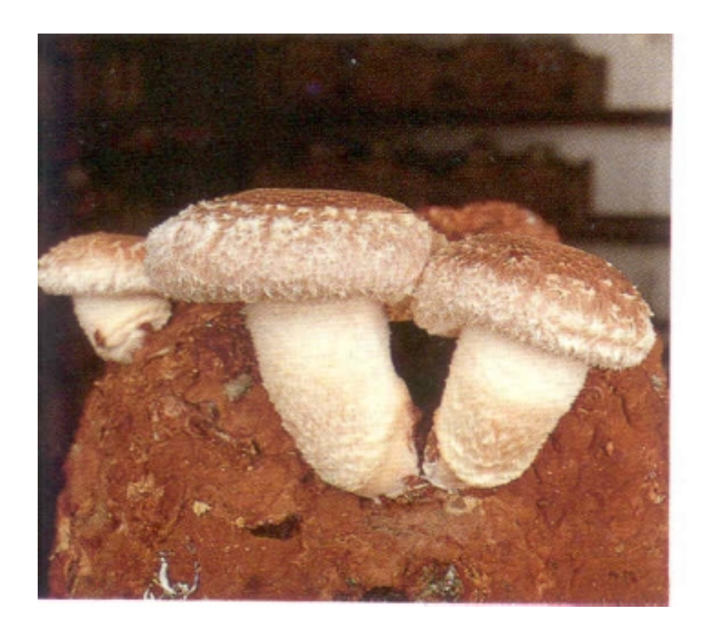
Fig. 2c L. edodes growing on sawdust logs

chestnut, beech, oak, shia, alder etc. However, it has been grown artificially for centuries on cut logs which can support seasonal fruiting. In more recent times, mass cultivation has predominantly been achieved by the sawdust culture technology. In China it is known as Xiang gu (fragrant mushroom) and as Shiitake in Japan because of its historical association with the shia tree. This mushroom has been renowned in Japan and China for thousands of years both as a food and as a medicine. It has a most exotic and delicious taste and is a central part of many Oriental dishes and is increasingly being adopted in the West. There is little difference in flavour or mouth feel between mushrooms cultured on logs and those found in the wild on tree stumps or dead trees. However, sawdust cultured mushrooms now being marketed worldwide are considered to be soft in texture and