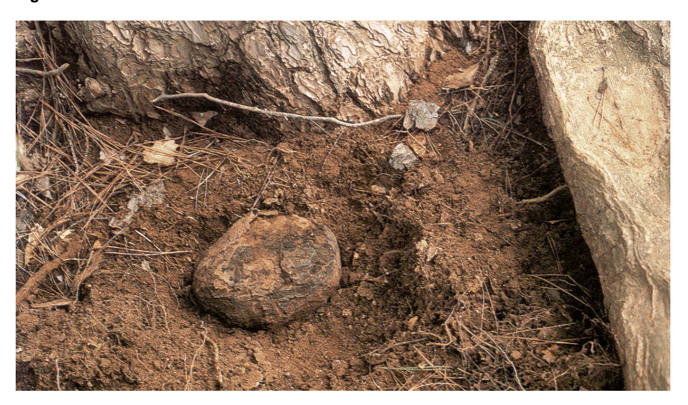
Fig. 4 Poria cocos sclerotium at base of tree

This fungus, sometimes referred to as Wolfiporia cocos , is the most commonly used of all Chinese medicinal fungi. It is called Hoeleu or Fu Ling in Chinese which refers to the hard sclerotium of the fungus. This is a mycorrhizal fungus growing in association with the roots of various conifers, especially Chinese red pine. Large tuberculiform structures – the sclerotia – are formed underground and can be collected all year round but especially early autumn (Liu and Bau, 1980). Apart from the medicinal uses, the large sclerotial structures have been used as food in Nigeria and in parts of Eastern and Southern US – "Indian bread".