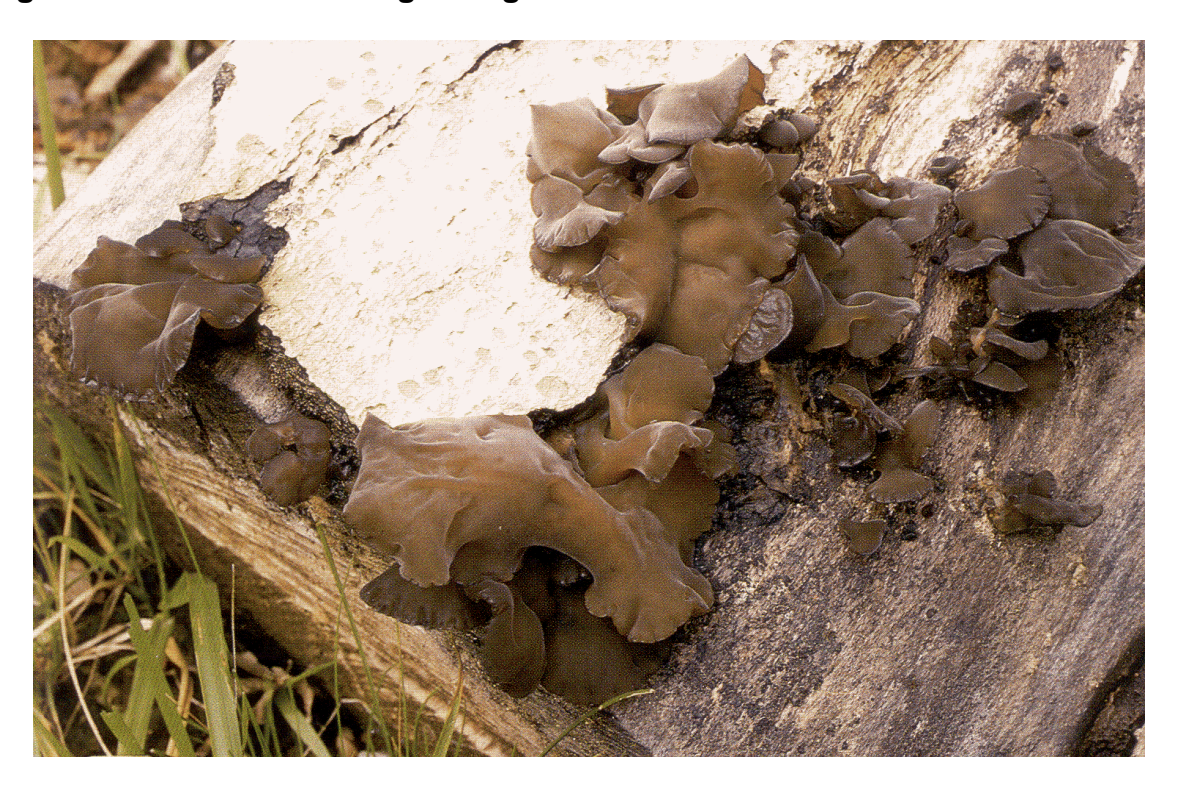
Fig. 5 Auricularia auricula growing on fallen timber

This fungus is widely known as Jew's ear (a contraction of Judas' ear), wooden ear, or tree ear and in Japan, Kikurage . They are facultative parasites growing on trunks of many broadleaf trees or on dead wood (Hobbs, 1995). The fruiting body is gelatinous, elastic, rubber in texture and widely used in Chinese cuisine. However, it is an acquired taste! It is widespread in United States, Europe