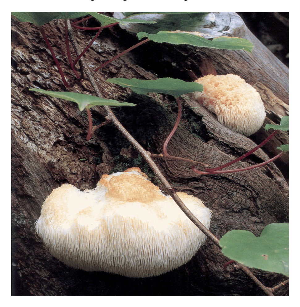
Fig. 6 Hericium erinaceus growing on fallen log

This is an edible mushroom occurring widely in Japan and China, growing on standing and decayed broadleaf trees such as oak, walnut and beech. It can also cause heart rot in standing trees. Originally collected from the wild, it is now extensively grown artificially on logs and sawdust mixtures making this mushroom available all the year round. It is known in the West as the hedgehog or monkey head fungus and in China as Shishigashida because the fruiting body looks like the head of a lion. When air dried and extracted with hot water it is used extensively in traditional Chinese medicine (Houtou), to promote digestion and general vigour, strength and general nutrition. The polysaccharide from this mushroom have cytostatic effects on gastric, oesophageal, hepatic and skin cancers (Mizuno, 1999;