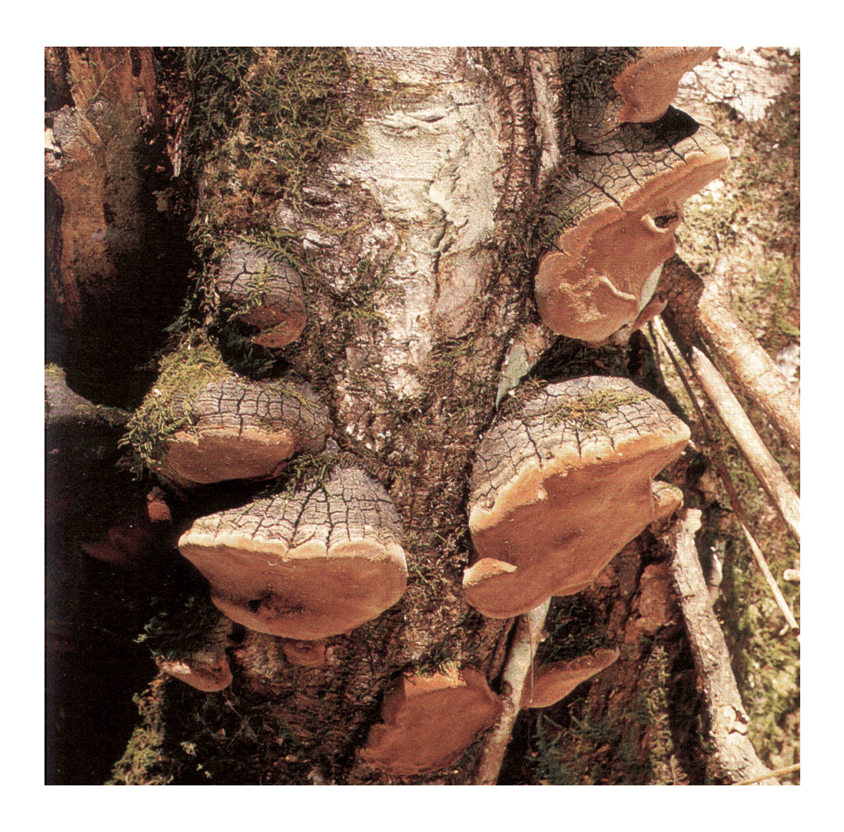
Fig. 3 Phellinus sp. growing naturally on deciduous tree

The fruiting-bodies of this fungus are called 'song gen' in Chinese medicine and 'meshimakobu' in Japanese. The fungus grows as a parasite mostly on living deciduous trees (but occasionally on Pinus spp.) in Japan and Korea but also in